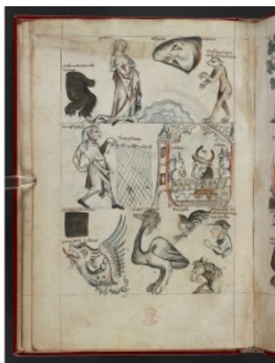
fol. 24v – Capricorn I