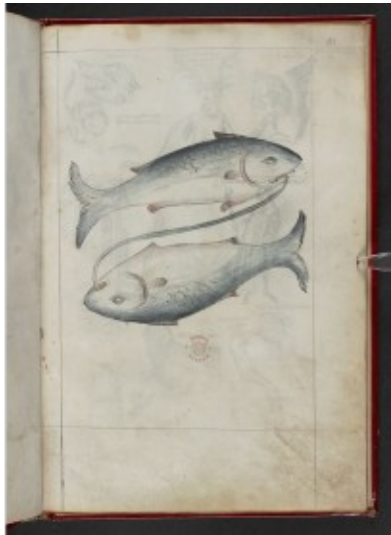
fol. 29r – Pisces