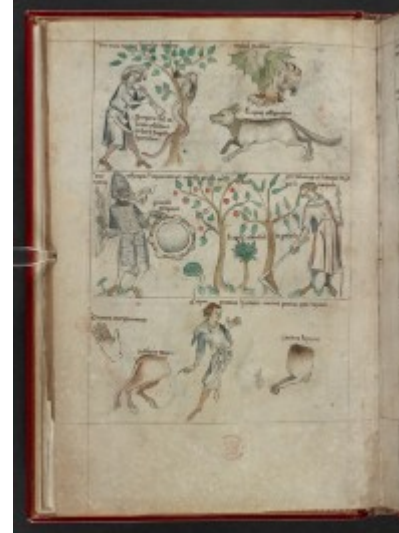
fol. 12v – Gemini II