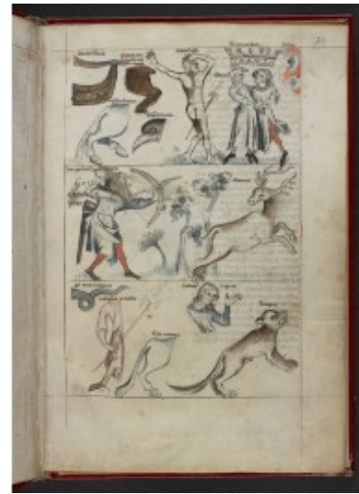
fol. 22r – Libra III