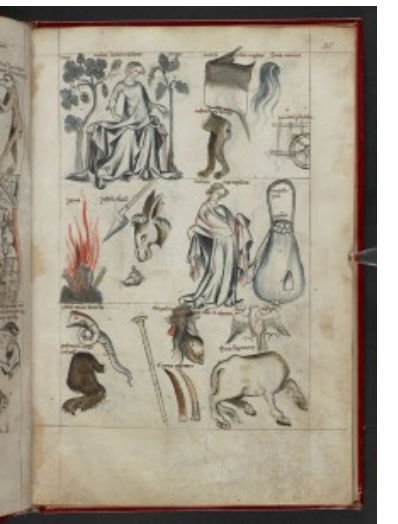
fol. 25r – Capricorn II