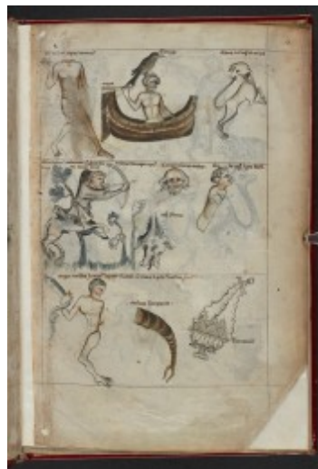
fol. 10r – Sagittarius I