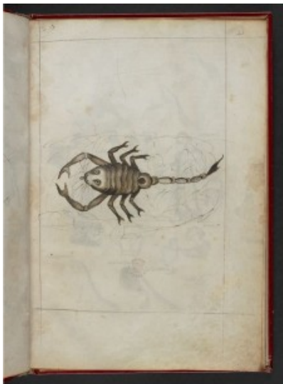
fol. 23r – Scorpio