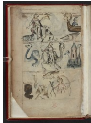
fol. 10v – Sagittarius II