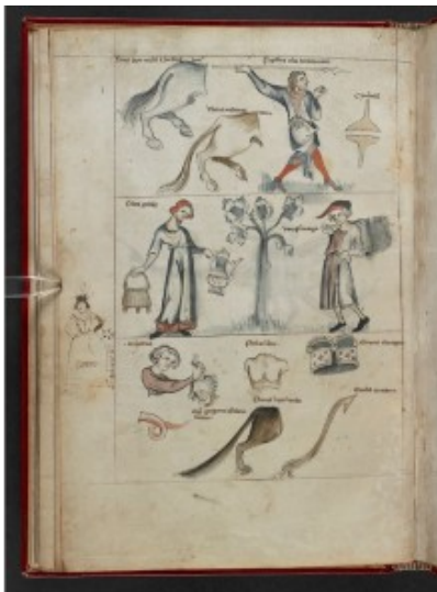
fol. 23v – Scorpio I