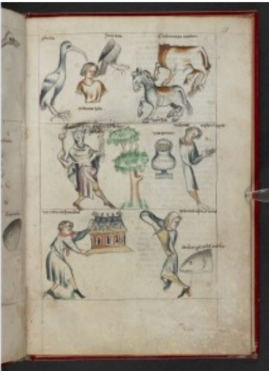
fol. 28r – Aquarius III