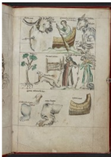
fol. 17r – Leo I