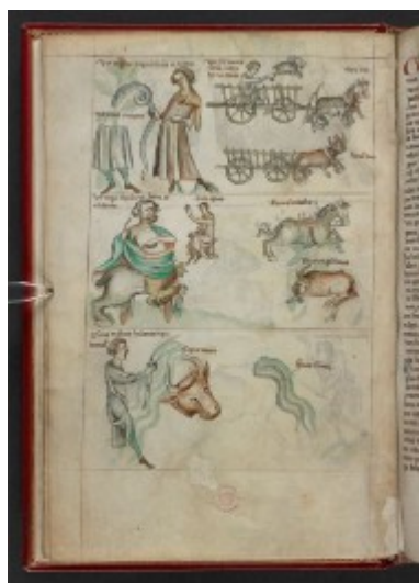
fol. 8r - Taurus III