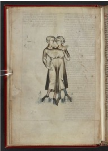
fol. 8v - Gemini