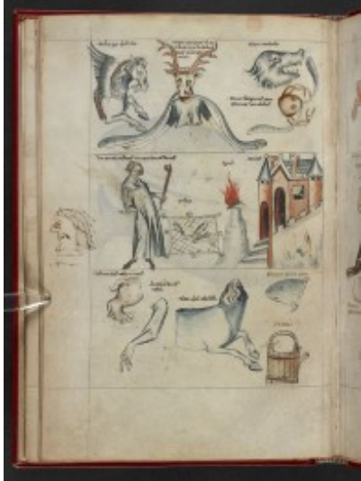
fol. 29v – Pisces I