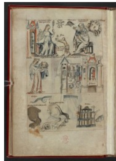
fol. 19v – Virgo I