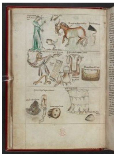
fol. 15v – Cancer III