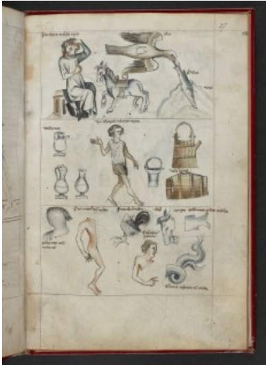
fol. 27r – Aquarius I