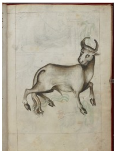
fol. 6v - Taurus