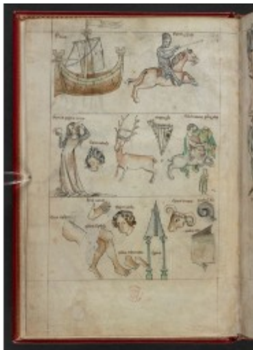
fol. 4v - Aries II