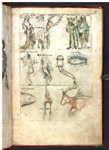
fol. 4r - Aries I