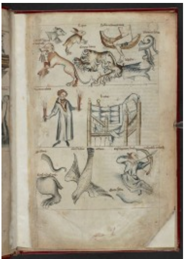
fol. 11r – Sagittarius III