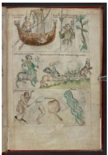
fol. 7v - Taurus II