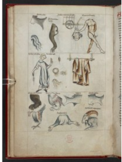
fol. 25r – Capricorn III