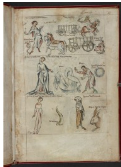
fol. 12r – Gemini I