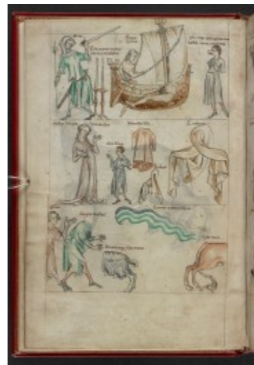
fol. 7r - Taurus I