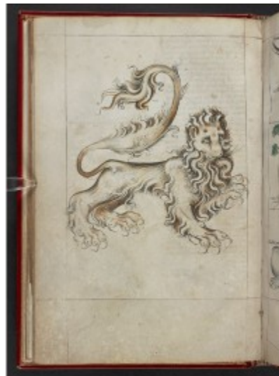
fol. 16v - Leo