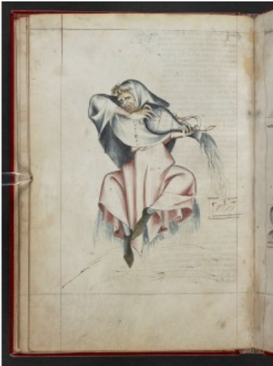
fol. 26v – Aquarius