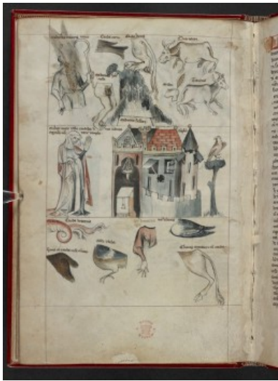
fol. 20v =-Virgo III