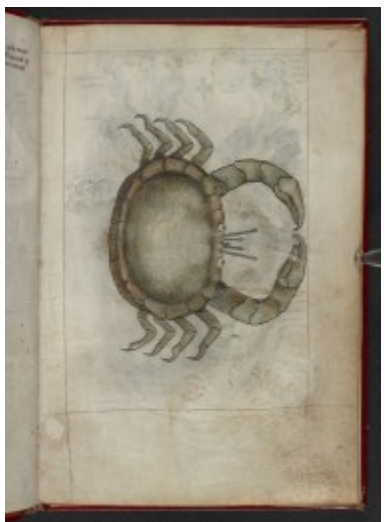
fol. 14r – Cancer