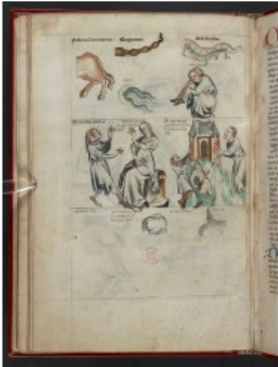
fol. 30r – Pisces II