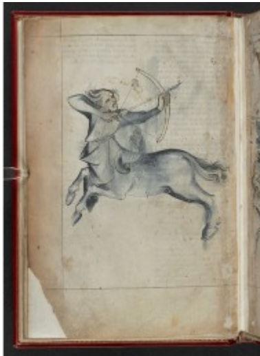
fol. 9v – Sagittarius