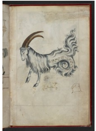
fol. 24r - Capricorn