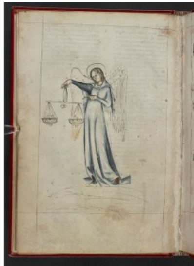
fol. 21v – Libra