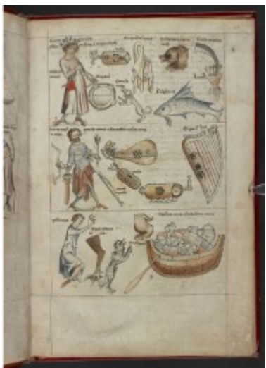
Fol. 13r – Gemini III