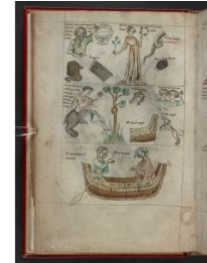
fol. 14v – Cancer I