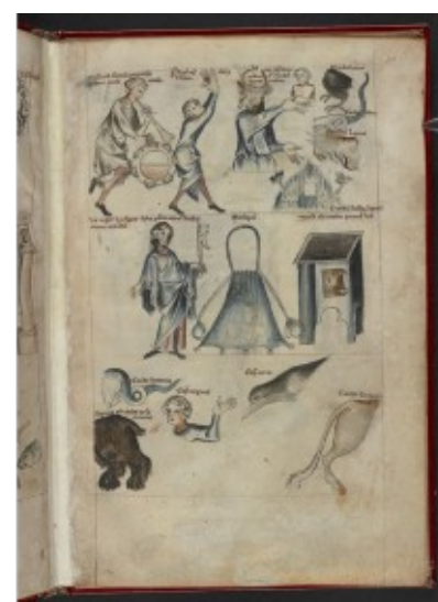
fol. 20r – Virgo II