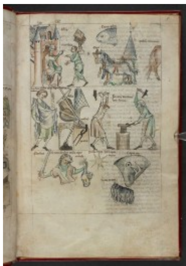
fol. 5r - Aries III