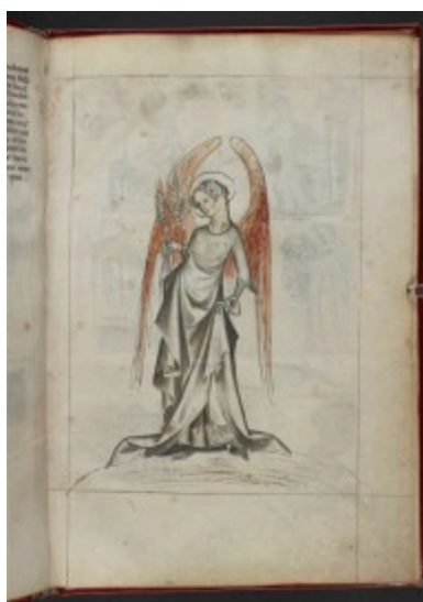
Fol. 19r – Virgo