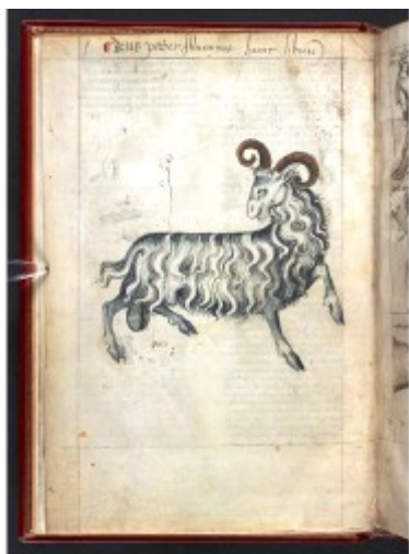
fol. 3v - Aries