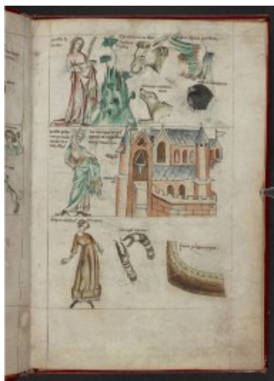
fol. 15r – Cancer II