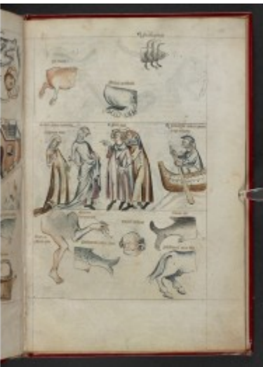
fol. 30v – Pisces III