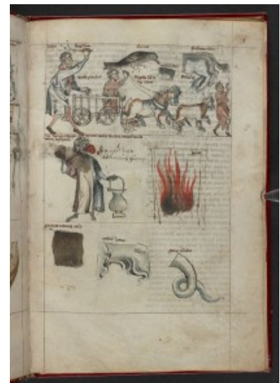
fol. 18r – Leo III