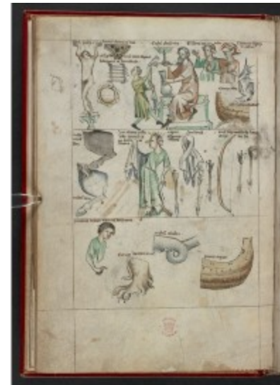
fol. 17v - Leo II