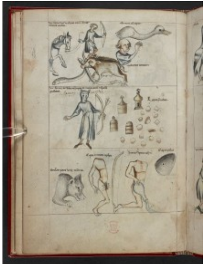
fol. 27v – Aquarius II