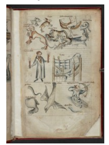
fol. 11r – Sagittarius III