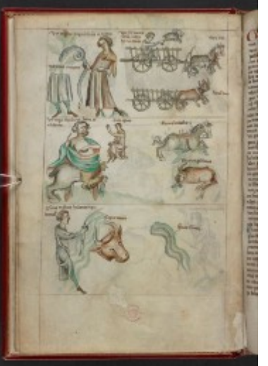
fol. 8r – Taurus III