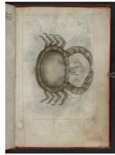
fol. 14r – Cancer