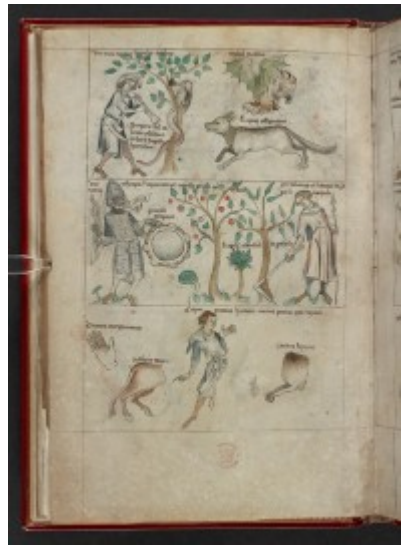
fol. 12v – Gemini II