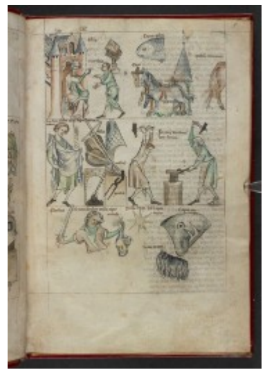
fol. 5r – Aries III