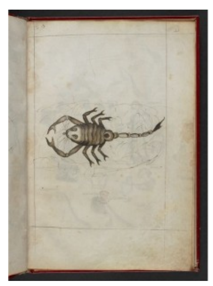
fol. 23r – Scorpio