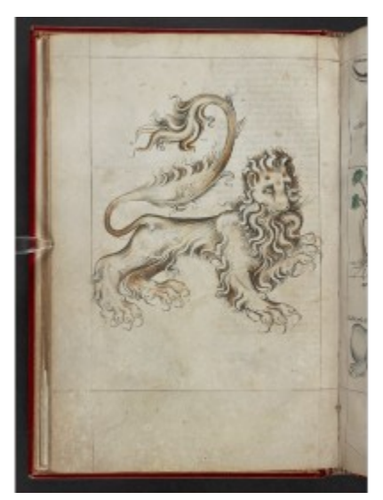
fol. 16v - Leo