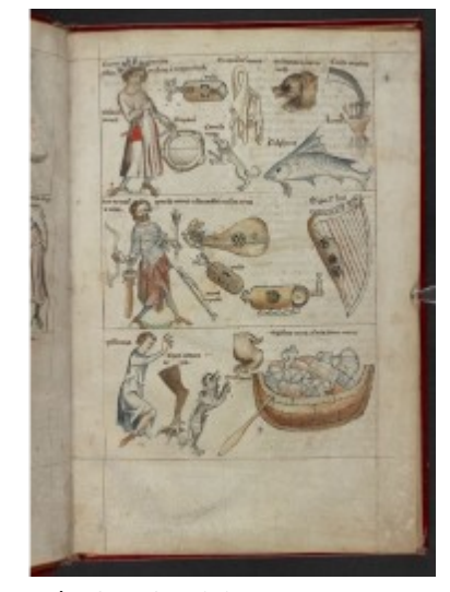
Fol. 13r – Gemini III