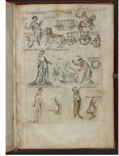
fol. 12r – Gemini I