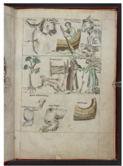
fol. 17r – Leo I