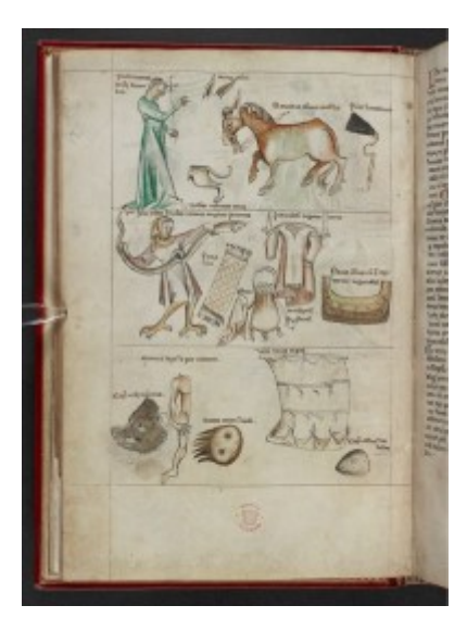
fol. 15v – Cancer III