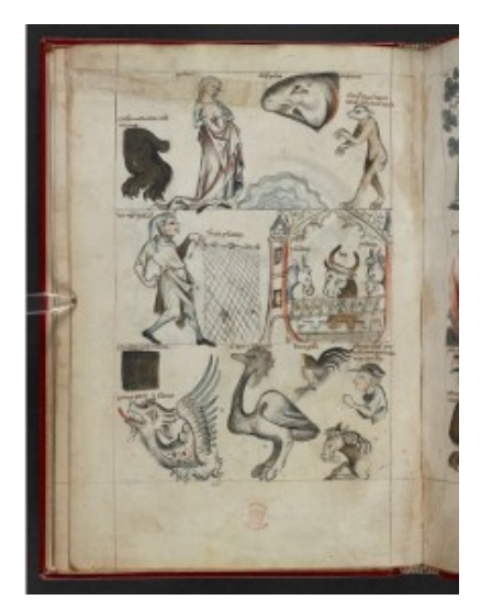
fol. 24v – Capricorn I