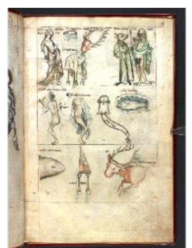
fol. 4r - Aries I