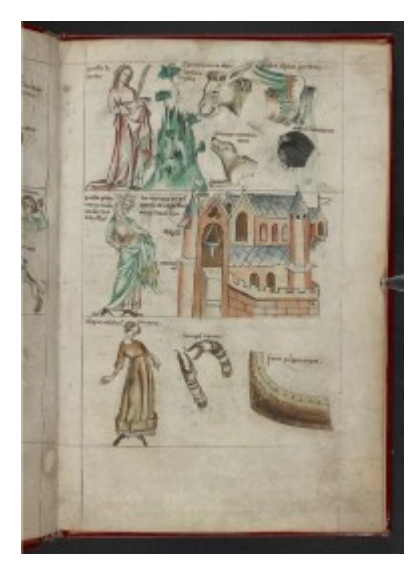
fol. 15r – Cancer II