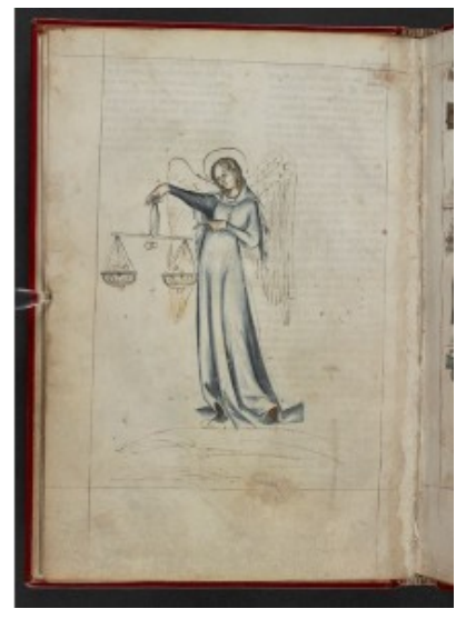
fol. 21v – Libra