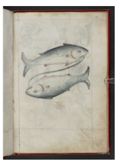
fol. 29r – Pisces