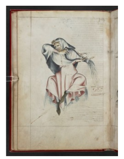
fol. 26v – Aquarius