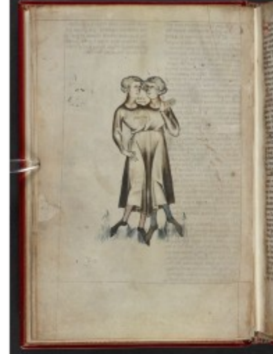
fol. 8v - Gemini