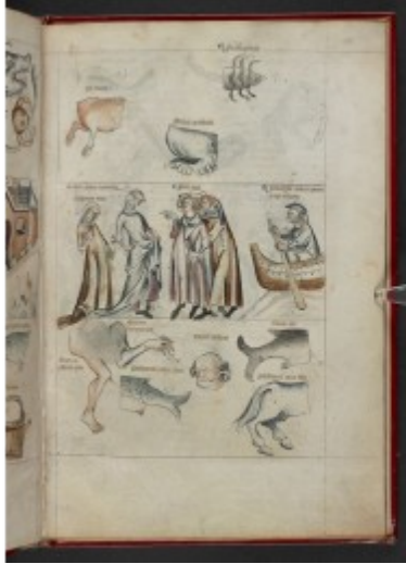
fol. 30v – Pisces III