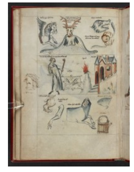
fol. 29v – Pisces I