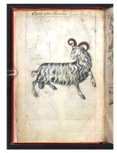
fol. 3v - Aries