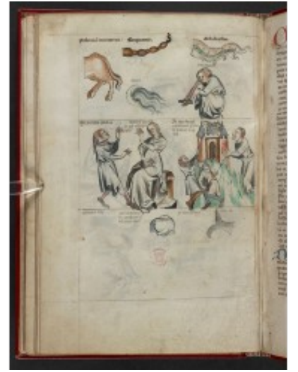
fol. 30r – Pisces II