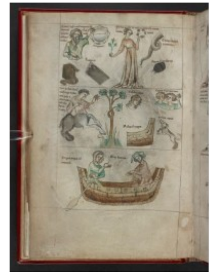
fol. 14v – Cancer I