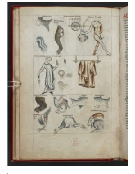
fol. 25r – Capricorn III