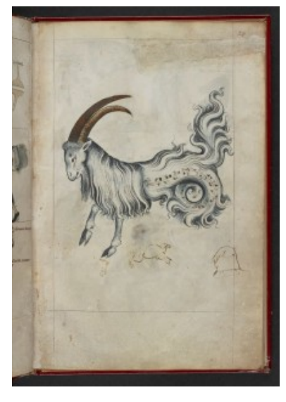
fol. 24r - Capricorn