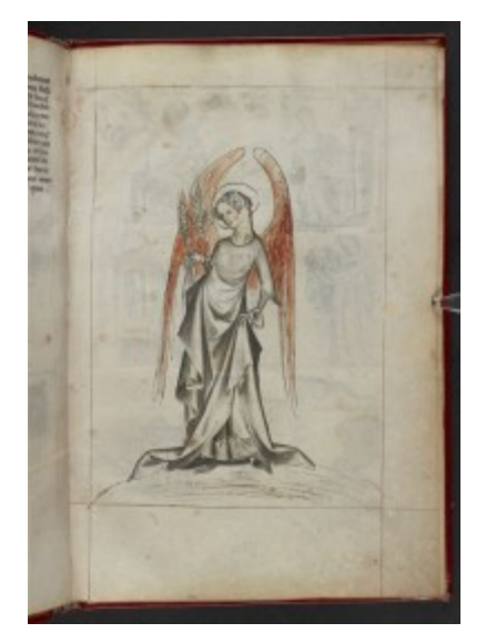
Fol. 19r – Virgo