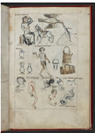
fol. 27r – Aquarius I