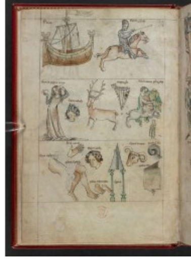
fol. 4v – Aries II