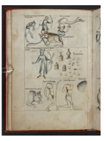
fol. 27v – Aquarius II