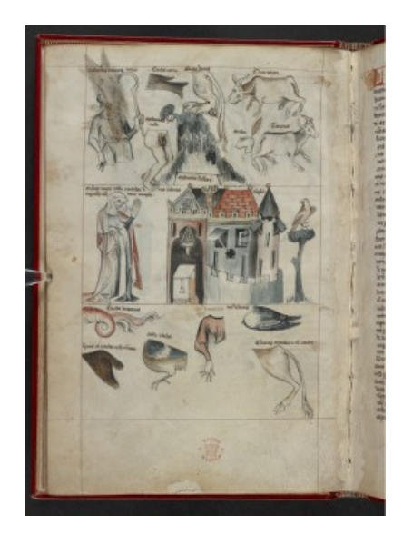
fol. 20v =-Virgo III