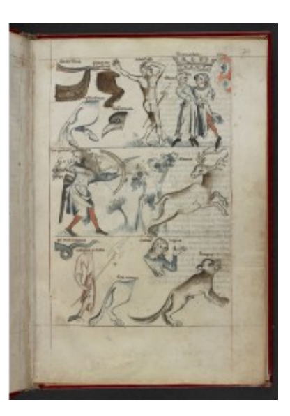
fol. 22r – Libra III