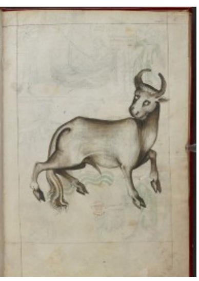
fol. 6v – Taurus