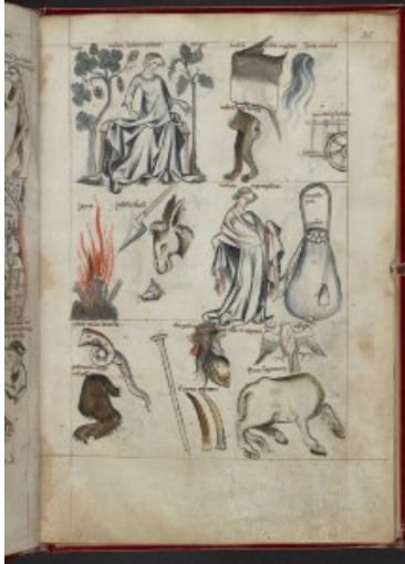
fol. 25r – Capricorn II